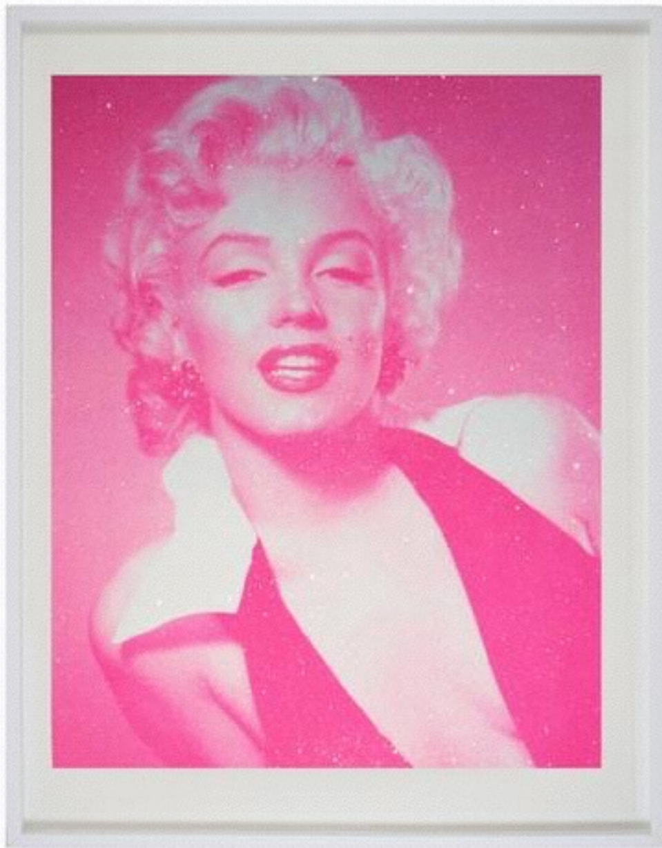
DAVID STUDWELL - MARILYN MONROE - CANDY FLOSS PINK (FRAMED)

https://theearthoundgallery.com/collections/david-studwell/products/david-studwell-marilyn-monroe-candy-floss-pink-framed